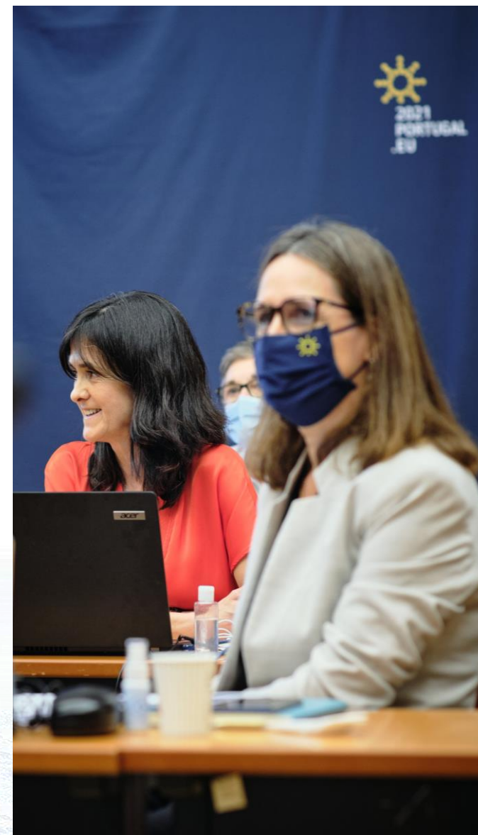
"most importantly: enjoying the ride"