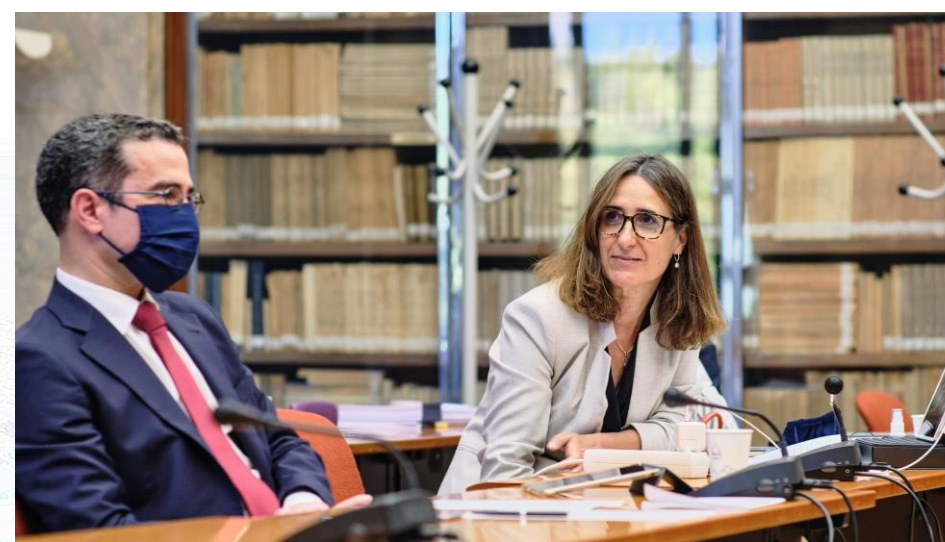
"listening carefully to all"