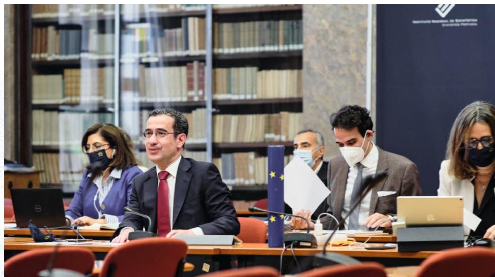
"passing the message across"