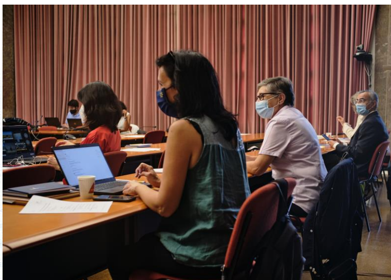
"there is no 'I' in Team"