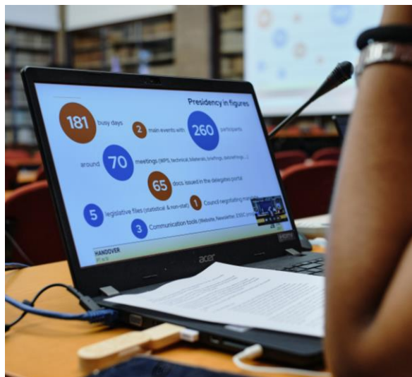
"take advantage from the disadvantage"