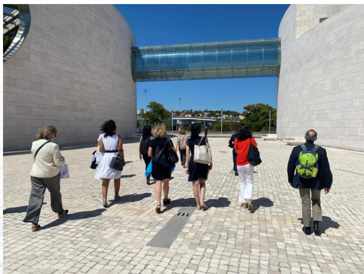
"moving forward and building bridges"