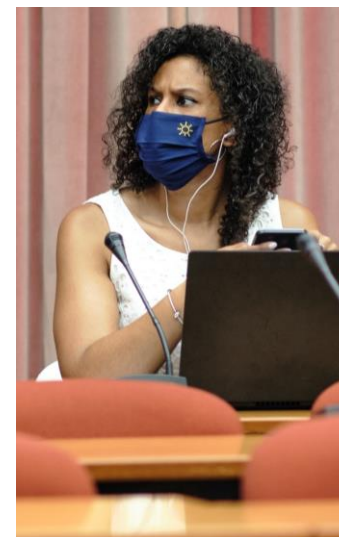
"where's the meeting link?"