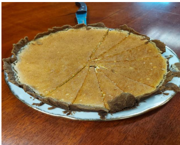
"If SAIO gives you lemons, make lemon pie..."