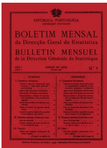
Monthly Bulletin made available by the General Directorate of Statistics (DGE): the first issue published by the DGE on January 1929

The BME is available in PDF format, in Portuguese and English versions. Under the Publications menu of Statistics Portugal's website, you can also access all previous editions of the BME.