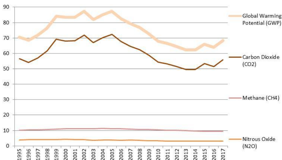
Chart 1: Greenhouse gas emissions, 1995 - 2017

Source: Statistics Portugal ( Air Emissions Accounts )