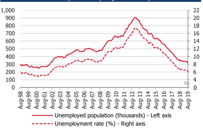
Figure 2: Unemployed population and unemployment rate (seasonally adjusted data)

Note: The August 2019 estimates are provisional.