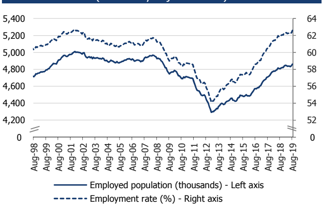
Figure 1: Employed population and employment rate (seasonally adjusted data)

Note: The August 2019 estimates are provisional.